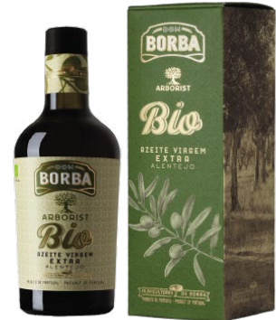
Azeite Virgem Extra Dom Borba Bio Variedades Galega e Cobrançosa | Acidez Máxima 0,3% cod 507824 | 500ml | EAN 5602625208127 | 1 un cod 507825 | 2 x 500ml | EAN 5602625208110 | 2 un