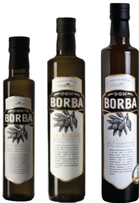
Azeite Virgem Extra Dom Borba Seleção Variedades Galega e Cobrançosa | Acidez Máxima 0,3% cod 507820 | 250ml | EAN 5602625208028 | 6 un cod 507821 | 500ml | EAN 5602625208011 | 12 un cod 507822 | 750ml | EAN 5602625208035 | 6 un cod 507823 | Pet 5L | EAN 5602625150112 | 2 un