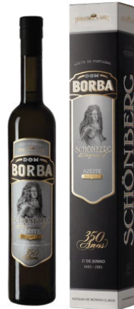
Azeite Virgem Extra Dom Borba Schonberg Variedades Galega e Cobrançosa Acidez Máxima 0,3% cod 507826 | 500ml | 1 un