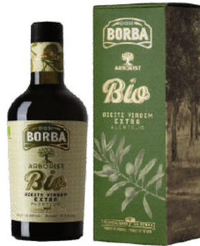
Azeite Virgem Extra Dom Borba Bio Variedades Galega e Cobrançosa | Acidez Máxima 0,3% cod 507824 | 500ml | EAN 5602625208127 | 1 un cod 507825 | 2 x 500ml | EAN 5602625208110 | 2 un