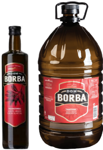
Azeite Virgem Dom Borba Tradicional Variedade Galega | Acidez Máxima 1,0% cod 507814 | 750ml | EAN 5602625150143 | 6 un cod 507815 | Pet 3L | EAN 5602625150181 | 3 un cod 507816 | Pet 5L | EAN 5602625150129 | 2 un