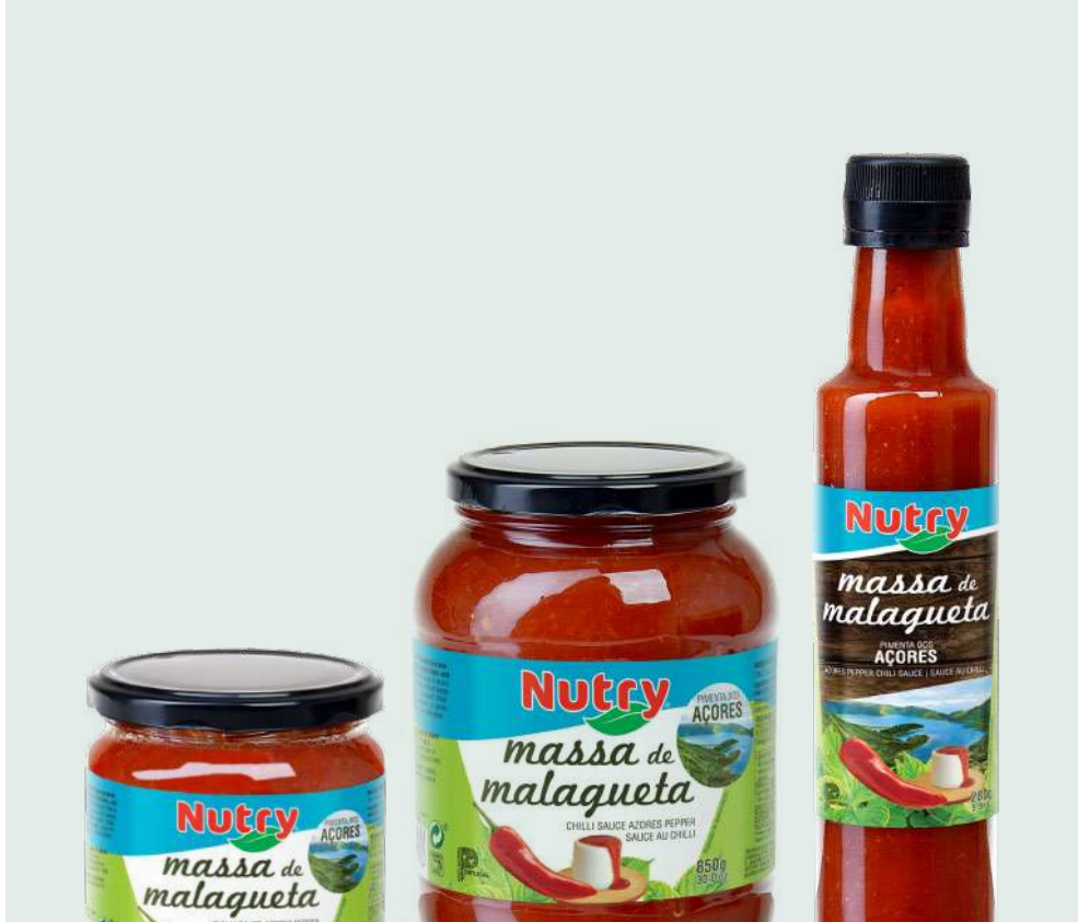
Massa de Malagueta | Chilli Sauce | Sauce au Chilli cod. 3997 | EAN 5602109017375 | 350g | 6 Un cod. 4020 | EAN 5602109017436 | 850g | 6 Un cod. 3996 | EAN 5602109017368 | 280g | 6 Un