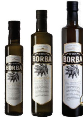
Azeite Virgem Extra Dom Borba Selecção Variedades Galega e Cobrançosa | Acidez Máxima 0,3% cod 507820 | 250ml | EAN 5602625208028 | 6 un cod 507821 | 500ml | EAN 5602625208011 | 12 un cod 507822 | 750ml | EAN 5602625208035 | 6 un cod 507823 | Pet 5L | EAN 5602625150112 | 2 un