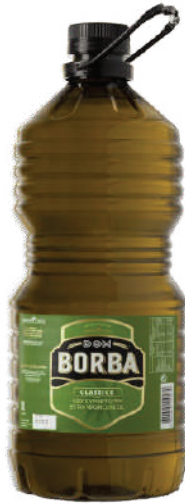
Azeite Virgem Extra Dom Borba Clássico Variedade Galega | Acidez Máxima 0,8% cod 507818 | Pet 3L | EAN 5602625150174 | 3 un cod 507819 | Pet 5L | EAN 5602625150112 | 2 un