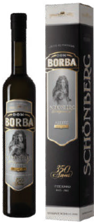
Azeite Virgem Extra Dom Borba Schonberg Variedades Galega e Cobrançosa Acidez Máxima 0,3% cod 507826 | 500ml | 1 un