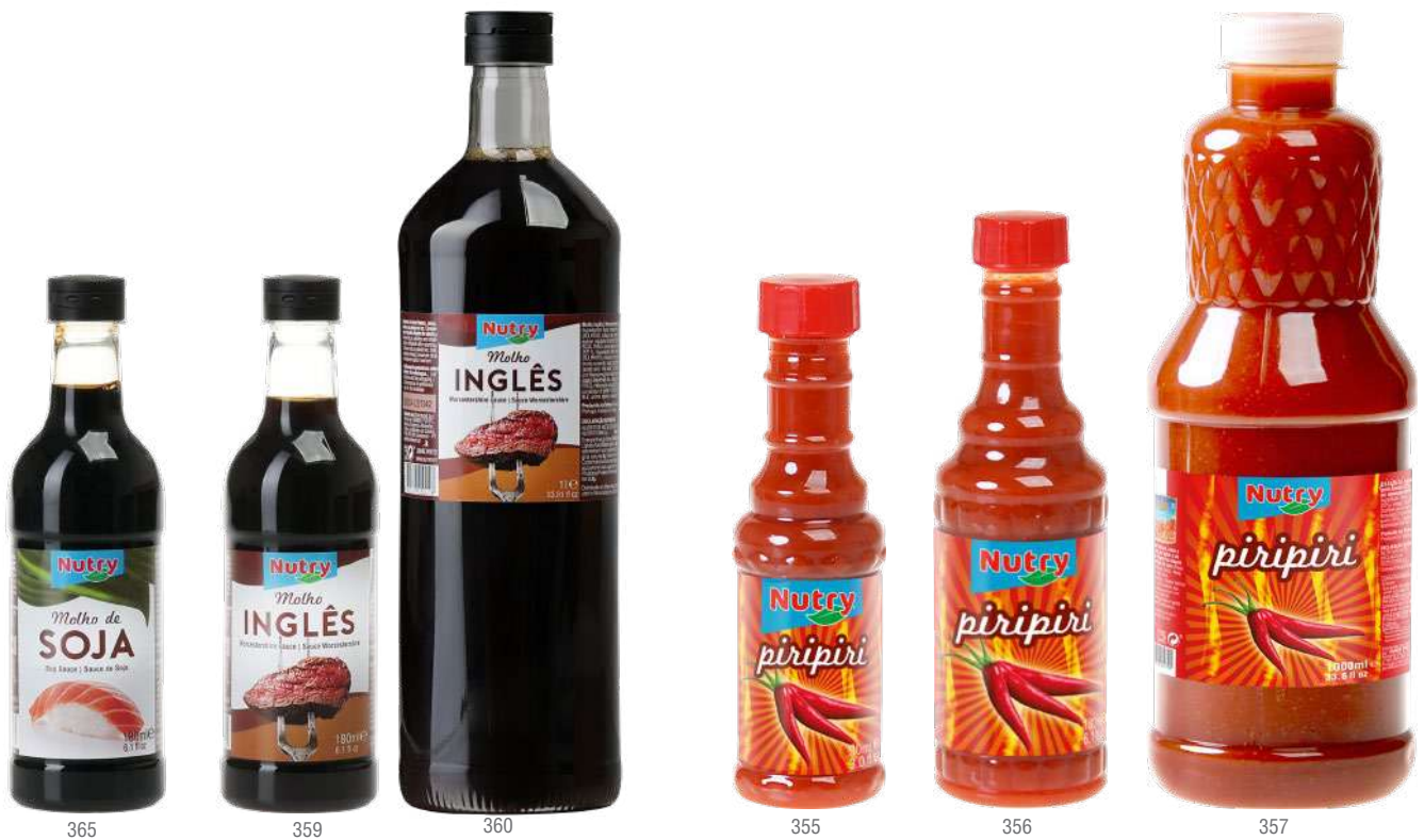
Molho de Soja | Soy Sauce | Soya Sauce cod. 365 | EAN 5602109002753 | 180ml | 12 Un