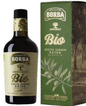
Azeite Virgem Extra Dom Borba Bio Variedades Galega e Cobrançosa | Acidez Máxima 0,3% cod 507824 | 500ml | EAN 5602625208127 | 1 un cod 507825 | 2 x 500ml | EAN 5602625208110 | 2 un