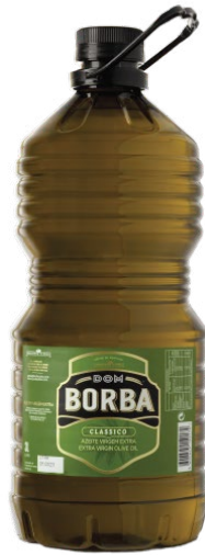
Azeite Virgem Extra Dom Borba Clássico Variedade Galega | Acidez Máxima 0,8% cod 507818 | Pet 3L | EAN 5602625150174 | 3 un cod 507819 | Pet 5L | EAN 5602625150112 | 2 un