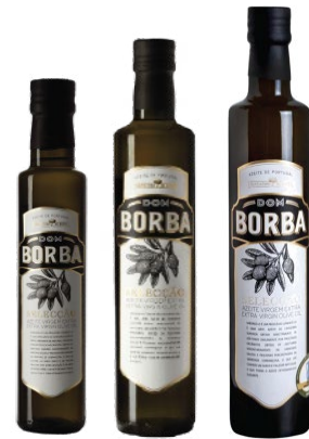
Azeite Virgem Extra Dom Borba Selecção Variedades Galega e Cobrançosa | Acidez Máxima 0,3% cod 507820 | 250ml | EAN 5602625208028 | 6 un cod 507821 | 500ml | EAN 5602625208011 | 12 un cod 507822 | 750ml | EAN 5602625208035 | 6 un cod 507823 | Pet 5L | EAN 5602625150112 | 2 un