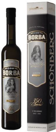
Azeite Virgem Extra Dom Borba Schonberg Variedades Galega e Cobrançosa Acidez Máxima 0,3% cod 507826 | 500ml | 1 un