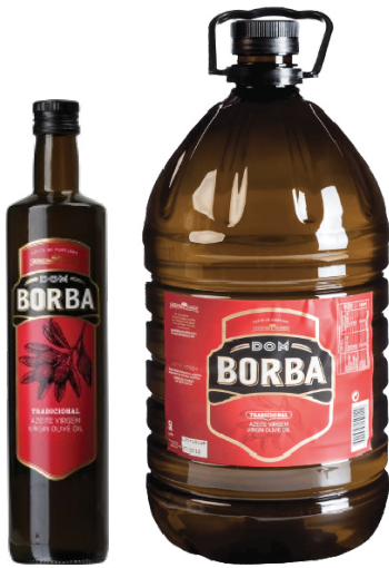
Azeite Virgem Dom Borba Tradicional Variedade Galega | Acidez Máxima 1,0% cod 507814 | 750ml | EAN 5602625150143 | 6 un cod 507815 | Pet 3L | EAN 5602625150181 | 3 un cod 507816 | Pet 5L | EAN 5602625150129 | 2 un